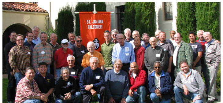
Men's Annual Retreat from a previous year.